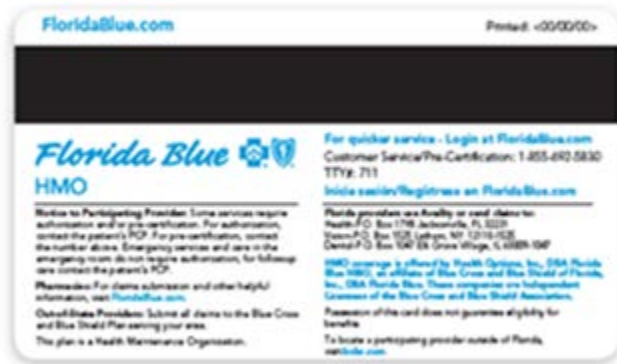
Back of ID Card